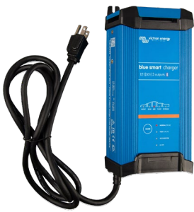
Blue Smart IP22 12/30 (3)