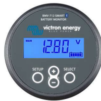
BMV-712 Smart Battery Monitor